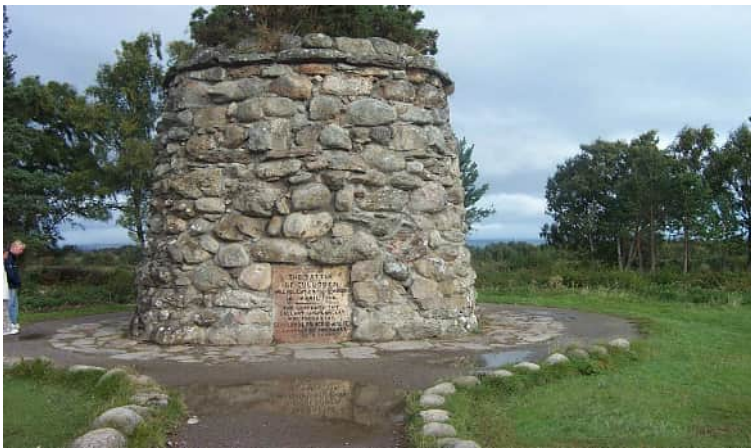
Figure 46: The Jacobite Memorial Cairn at the Culloden Battlefield.