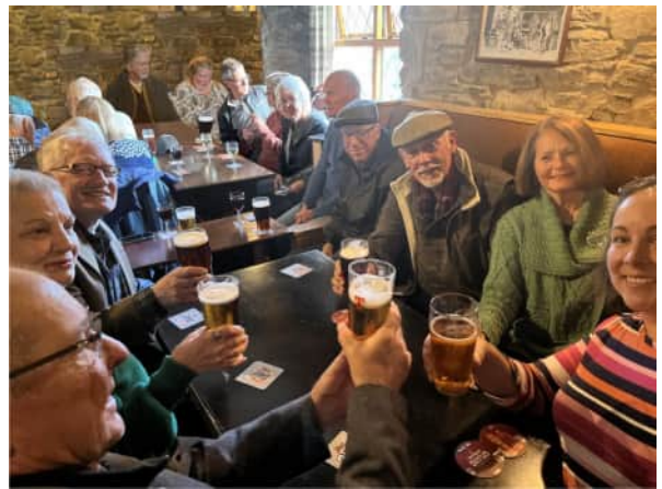
Figure 51: The Old Smiddy Inn, Thrumster Wick