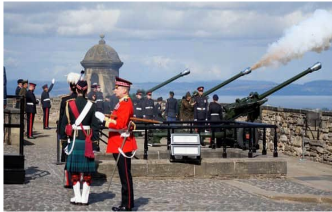
Figure 37: The Accession Day 21 Gun Salute

Day 4, the baronial fireplace and artifacts at Sir Walter Scott's Abbotsford House.