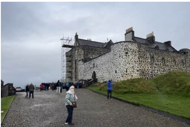
Figure 70: Duart Castle, Mull

For Day 12 we boarded a ferry to Mull followed by a 75 mile drive around the Isle. Stops included Duart Castle, for over 700 years the seat of Clan Maclean, dominating the view to the Sound of Mull and Loch Linnhe with its huge curtain walls and solid keep and Tobermory, widely considered the prettiest and most iconic village on the Isle, famed for its brightly painted, candy-colored buildings lining a scenic harbor.