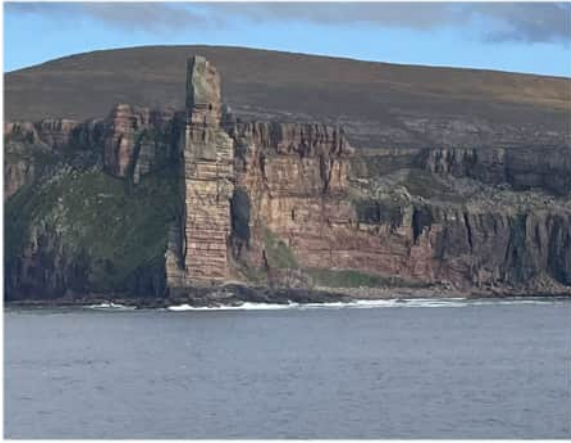
Figure 52: Dramatic cliffs and the Old Man of Hoy as seen from the ferry Hamnavoe.

Day 8 featured nautical travel to the Orkney Islands via the Scrabster to Stromness Ferry crossing, with views of the Old Man of Hoy, Skara Brae and Skail House, the Ring of Brodgar, and Kirkwall, Lunch was provided at the Orkney Brewery's Tasting Hall cafe.