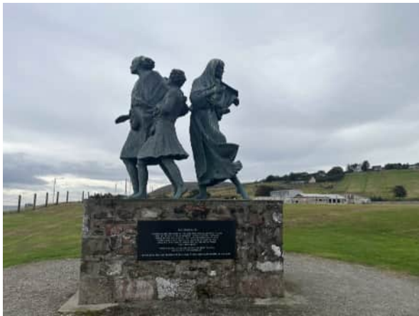
Figure 50: Statue in Helmsdale commemorating Scottish emigre's.