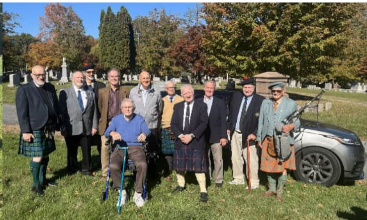
Figure 19: Members and Friends of the St Andrew's Society of the City of Albany