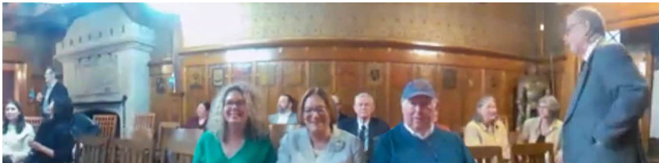
Figure 3: The Meeting Room, Members and Guests, May 8 th 2025

The third of the previous year's stated meetings of the Society took place on May 8th, 2025 at the Society's premises at 150 Washington Avenue, Albany, NY (i.e. "the Rooms"). This meeting was our annual Ladies Night and was very well attended with Members present and remote, and several guests!