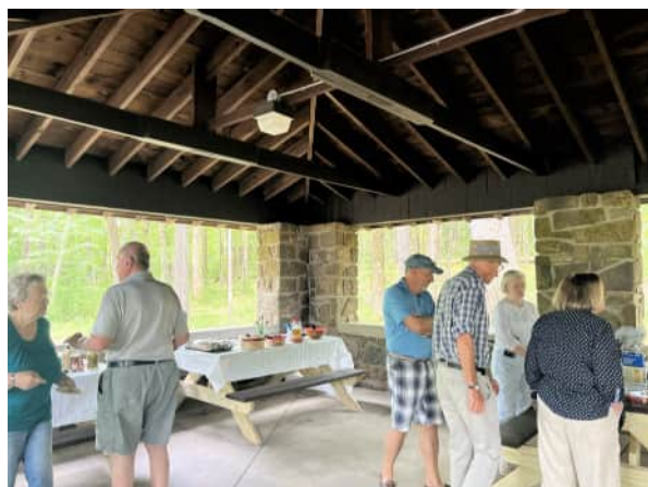
Figure 10: St Andrew's Societies of Albany and Schenectady Members and guests contemplating tables of victuals