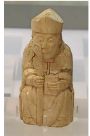
Figure 28: Lewis Chessman

In September, William and Victoria Storrs visited Iona and Castle Tioram, on the tidal island Eilean Tioram in Loch Moidar, ancient seat of Clanranald. Attached are their photos of Tioram and St Oran's Chapel, a historic medieval chapel built by the MacDonalds which is the oldest intact structure on Iona, dating back to the 12th century.