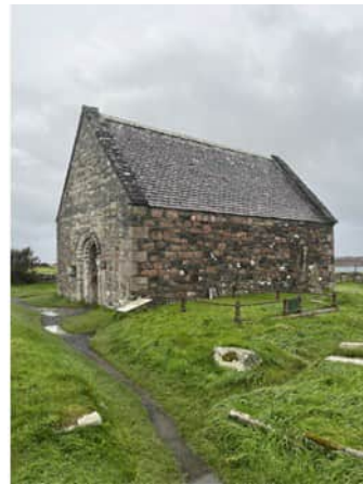
Figure 30: St Oran's Chapel, the oldest intact structure on Iona