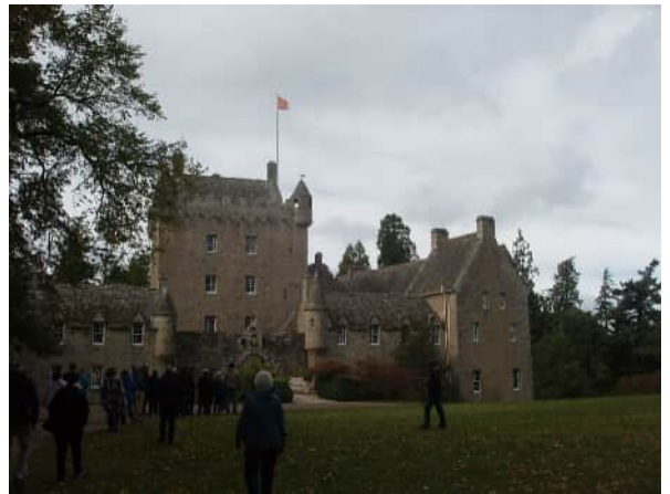
Figure 47: Cawdor Castle, in Nairnshire, Scotland was built around a 15th-century tower by the Calder family, it passed to the Campbells in the 16th century.