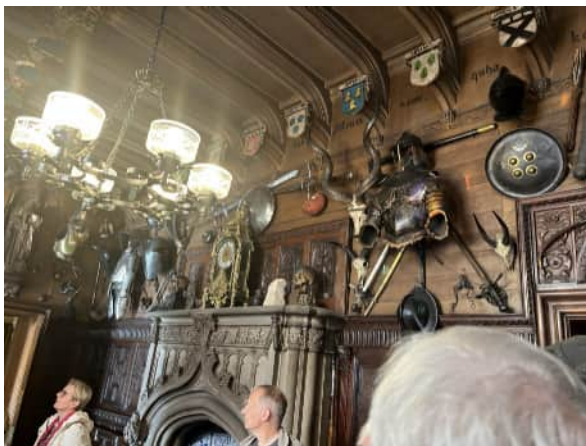
Figure 38: Esteemed for his collector's eye, Scott maintained an armory boasting an array of nearly four hundred items.

Day 4, the baronial fireplace and artifacts at Sir Walter Scott's Abbotsford House.