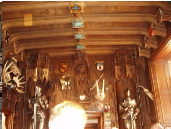
Figure 39: The Entrance Hall at Abbotsford; paneling of oak and cedar and carved ceilings