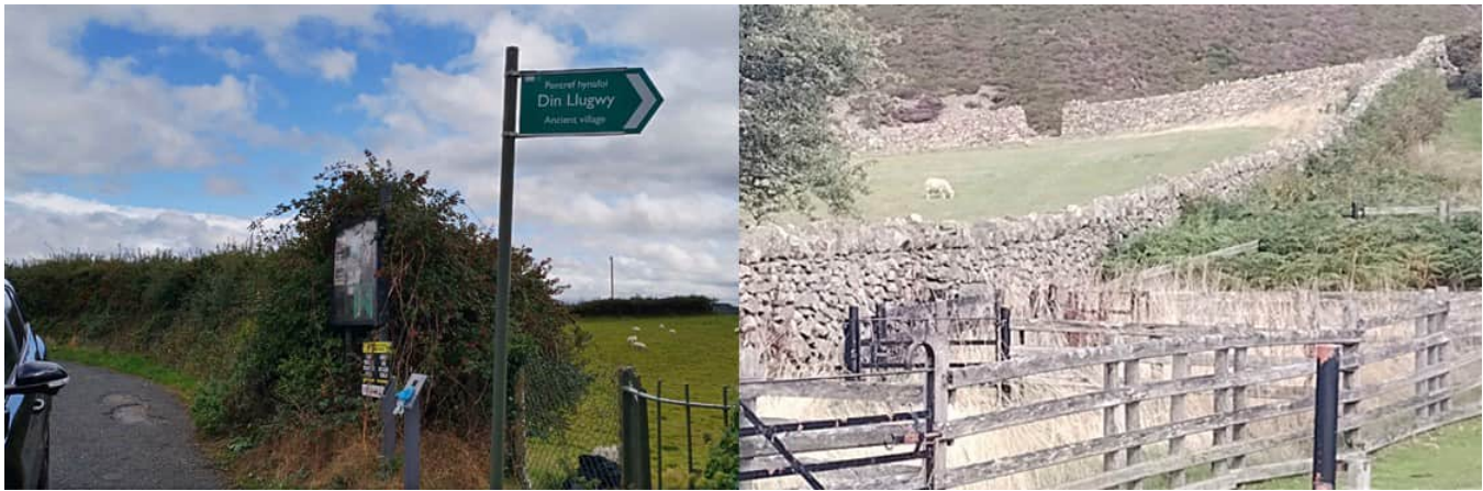
Figure 34: Sign for DinLlugwy site and later Roman foundation

Ancient burial ground at Din Llugwy dating back to 2500 bc adjacent to a Roman Campsite (from a later period).