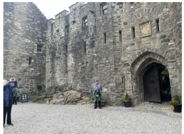
Figure 65: Striking Eilean Donan Castle is located at the intersection of Lochs Duich, Loch Long, and Loch Alsh.