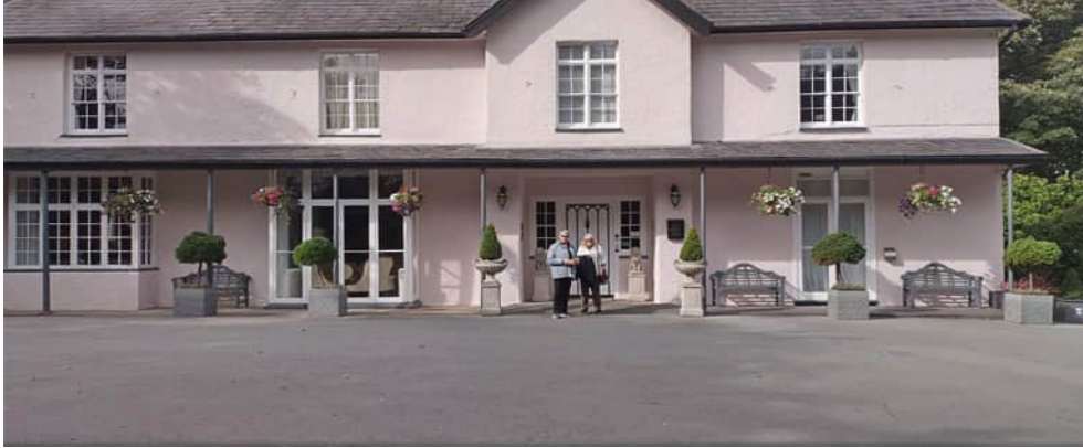
Figure 32: Plas Dinas