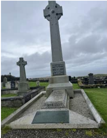
Figure 62: Grave-site of Flora MacDonald at Kilmuir.

Day 10's morning travel extended north across the magnificent Isle of Skye from Broadford at its southern end to Kilmuir near its northerly extent and the Museum of Island Life, on a hillside close to the tip of the Trotternish Peninsula. Afternoon stops included Portree and Eilean Donan to round out this 100 mile day.