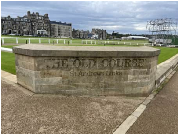
Figure 40: The Old Course

On day 5 we traveled northeast from Edinburgh to St. Andrews, crossing the Firth of Tay via Dundee to Pitlochry. From Pitlochry, a scenic drive through the Grampian Mountains and Cairngorms National Park en route to Inverness, for 200 miles on the day.