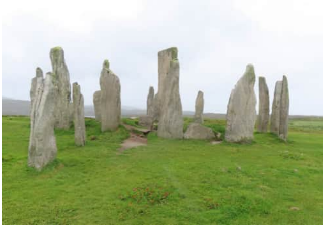
Figure 27: Callanish Stone Circle