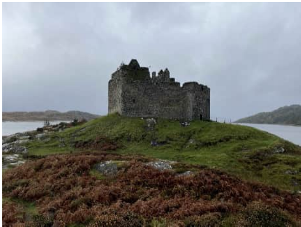
Figure 29: Castle Tioram

In September, William and Victoria Storrs visited Iona and Castle Tioram, on the tidal island Eilean Tioram in Loch Moidar, ancient seat of Clanranald. Attached are their photos of Tioram and St Oran's Chapel, a historic medieval chapel built by the MacDonalds which is the oldest intact structure on Iona, dating back to the 12th century.