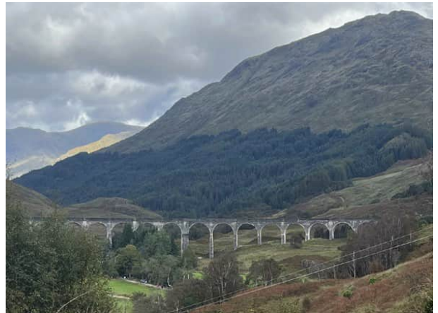
Figure 67: The Glenfinnan viaduct, oft seen in Harry Potter movies