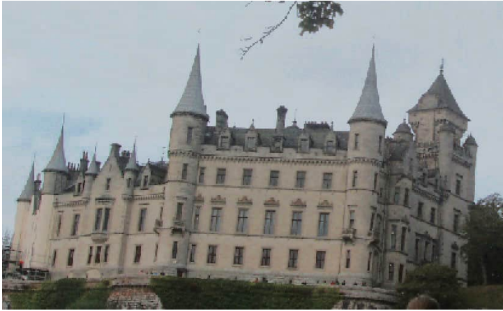
Figure 48: Dunrobin Castle

On Day 7 we ventured north to Dunrobin Castle, the most northerly of Scotland's great houses and the largest in the Northern Highlands. One of Britain's oldest continuously inhabited houses, Dunrobin dates back to the early 1300s, home to the Earls and later, the Dukes of Sutherland.