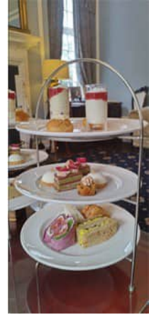
Figure 33: High Tea

Ancient burial ground at Din Llugwy dating back to 2500 bc adjacent to a Roman Campsite (from a later period).