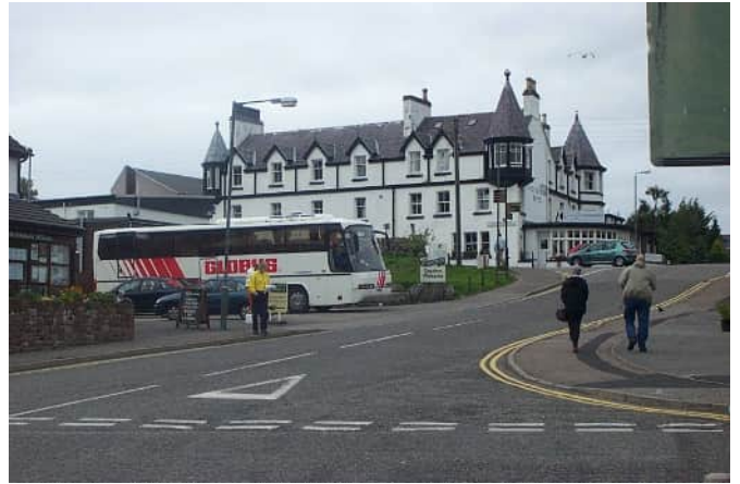
Figure 59: The Caledonian Hotel in Ullapool for fish and chips