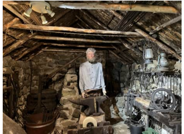
Figure 63: The smiddy shop in the Museum of Island Life