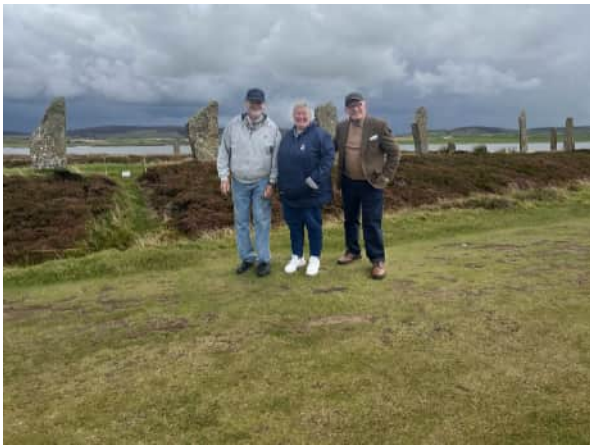
Figure 54: The Ring of Brodgar features 36 towering stones set in a near-perfect circle, another part of the Neolithic Orkney World Heritage Site, built around 2500–2000 BC.