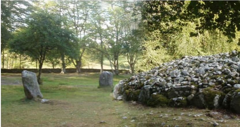
Figure 44: Clava cairns, Bronze Age circular chamber tomb cairn

With quite a few sites to see around Inverness, we didn't have to travel far on Day 6 to see the Bronze-Age chamber tomb site at Clava Cairns, the Culloden battlefield site and visitor center, and Cawdor Castle.