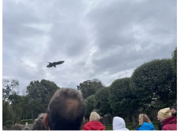
Figure 49: Demonstration at Dunrobin featuring birds of prey like Harris hawks and peregrine falcons.

By afternoon we had arrived in Thurso, the northernmost town on the British Isles and later that evening the iconic Old Smiddy Inn in Thrumster for entertainment by excellent young pipers at a Ceilidh hosted by Councillor Raymond Bremner, Leader of The Highland Council, for 109 miles on the day.