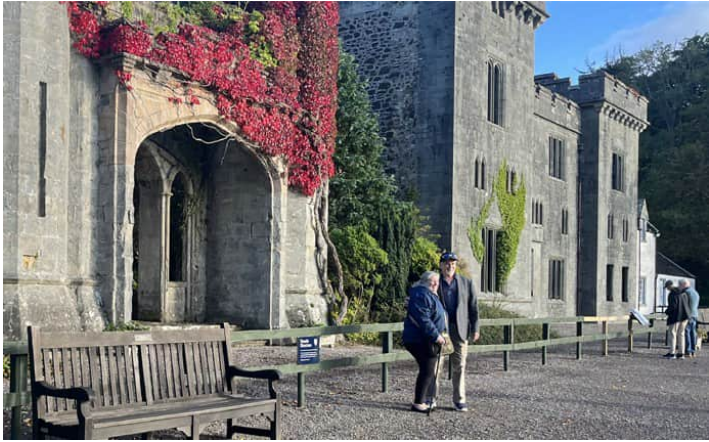
Figure 66: Armadale Castle faces south over the Sound of Sleat

Day 11's travel and visits included Armadale Castle, recently sold by the MacDonalads, and the Museum of the Isles in the morning, crossing the Sound of Sleat by ferry for an afternoon visit to Glenfinnan on route to Oban.