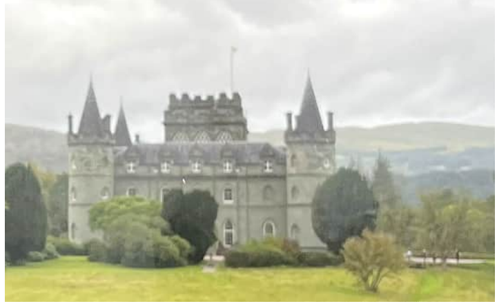
Figure 73: Inveraray Castle, ancestral home and seat of the Dukes of Argyll and the Chief of Clan Campbell.