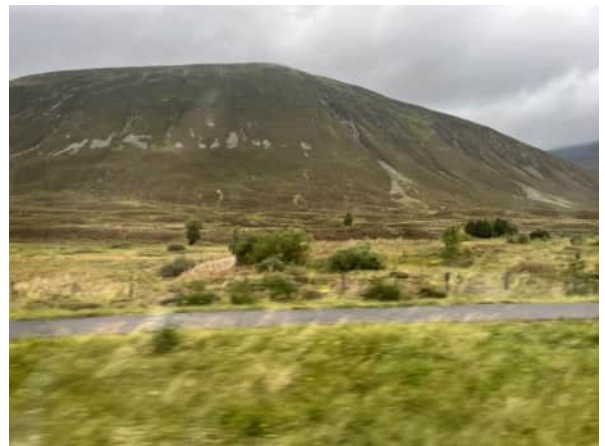
Figure 43: The Sow of Atholl (Meall an Dobharchain) is a glacially carved land-form visible while traveling north on the A9 and is part of the Grampians range.