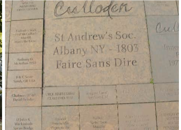
Figure 45: Our St Andrew's Society memorialized at the Culloden visitors center on a local Caithness pathway stone.