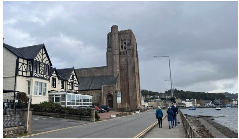
Figure 69: Oban Harbor

For Day 12 we boarded a ferry to Mull followed by a 75 mile drive around the Isle. Stops included Duart Castle, for over 700 years the seat of Clan Maclean, dominating the view to the Sound of Mull and Loch Linnhe with its huge curtain walls and solid keep and Tobermory, widely considered the prettiest and most iconic village on the Isle, famed for its brightly painted, candy-colored buildings lining a scenic harbor.