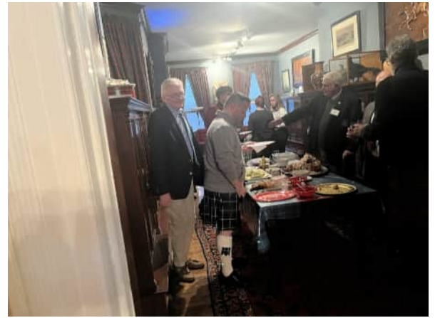
Figure 24: With two tables of food to choose from, nobody went home hungry!