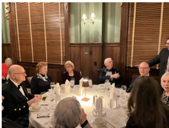
Figure 21: Members of the Society and Guests await the commencement of the festivities.