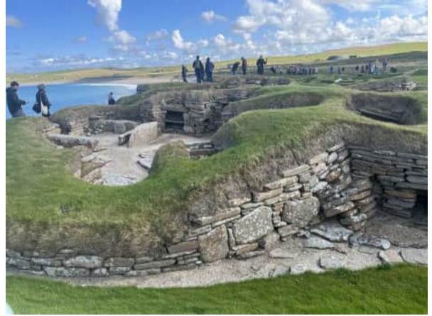
Figure 53: The Neolithic village of Skara Brae is older than the Egyptian pyramids