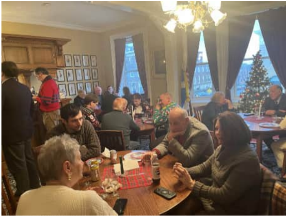
Figure 23: Our Christmas Party was well attended by our Members and guests including the St Andrews Society of Schenectady.