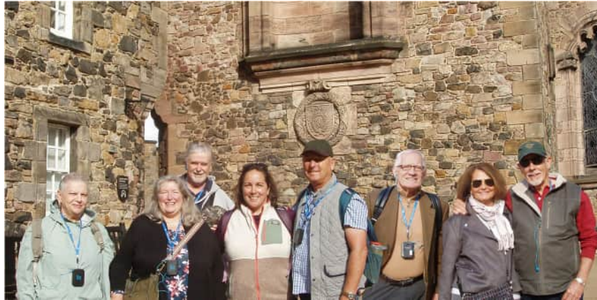
Figure 36: Our Society visits Edinburgh Castle

On our third day in country, our visit to Edinburgh Castle coincided with the third Anniversary of King Charles III's Accession to the Throne. At the Ceremony, the 105 th Regiment Royal Artillery, alongside the 160 th US Army National Guard, came together in a display of international camaraderie and military precision. The highlight? A thunderous 21-gun salute over the Firth of Forth that echoed through the ancient stones of the castle, paying tribute to the King.