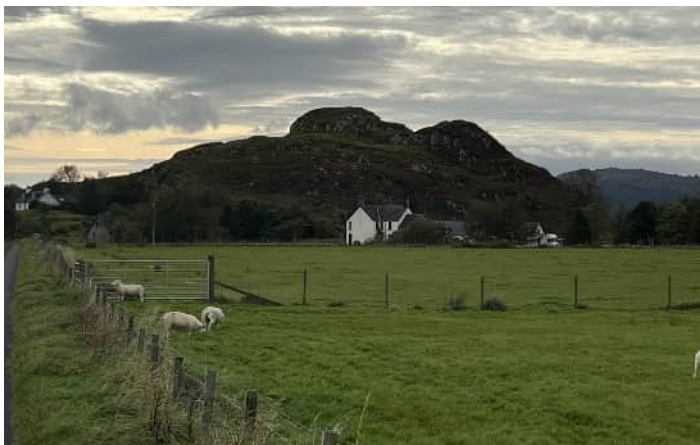
Figure 31: Dunadd Hill-fort was the capital of Dal Riata, first kingdom of the Scots.