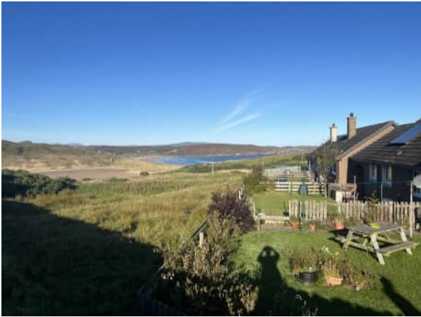
Figure 58: Crofting community in the Highland flow country near Lairg

Day 9 traversed 219 miles of magnificent peat-land scenery from Thurso on the north coast to the dark cuillins of Skye, the most northernmost of the inner Hebrides Islands. For lunch we stopped at the very picturesque village of Ullapool on Loch Broom.