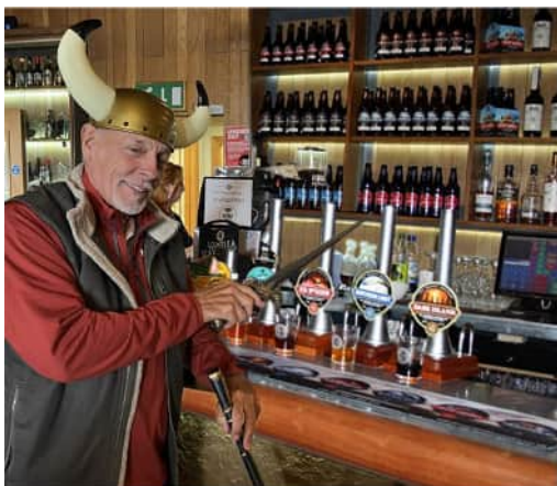
Figure 56: Skull Splitter Ale is fittingly named after Thorfinn Einarsson, the 7th Viking Earl of Orkney, around 950 AD.