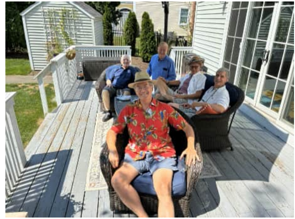
Figure 13: A Mellow Day to be Sure!