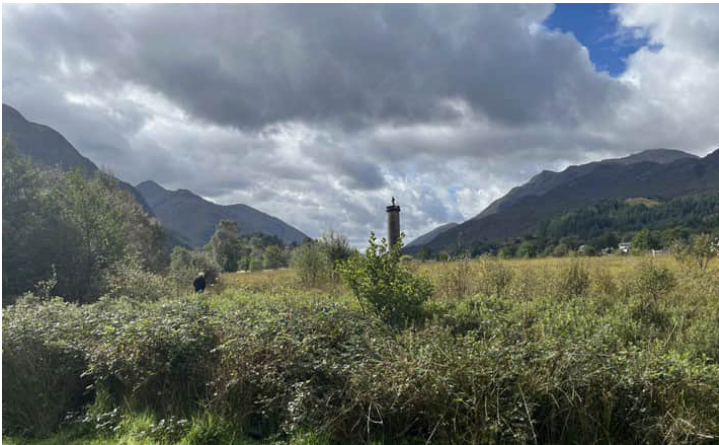
Figure 68: The Glenfinnan Monument commemorates the Highlanders who fought on the side of Charles Edward Stuart