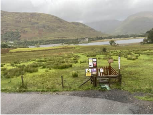
Figure 72: Kilchurn Castle, on the northeastern end of Loch Awe in Argyll and Bute

On Day 13 for our final day of coach travel, we traveled the 108 miles from Oban to Glasgow via the mountainous Pass of Bander and Inveraray, stopping at Loch Lomond for photos.