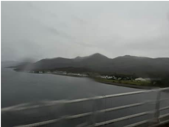
Figure 60: The village of Kyleakin on Skye as viewed on approach from the Skye Bridge