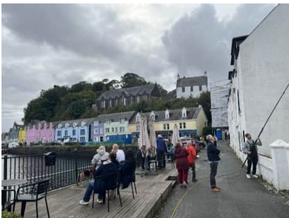
Figure 64: Portree, Capital of Skye