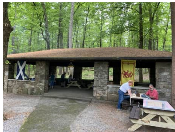
Figure 9: Two Society Members enjoy the rustic setting.