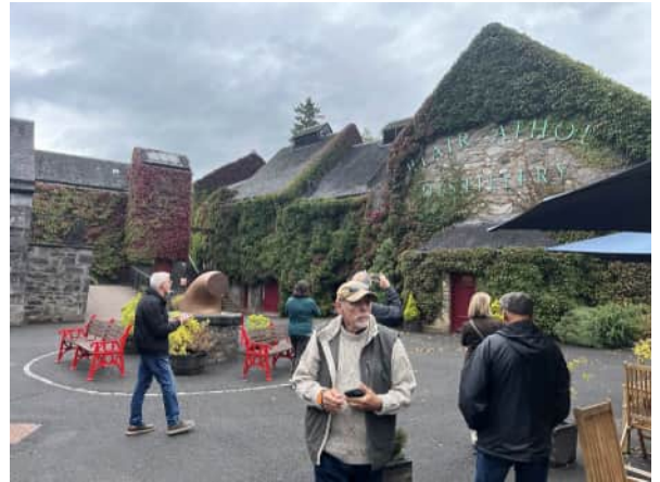
Figure 41: Blair Athol Distillery, Pitlochry