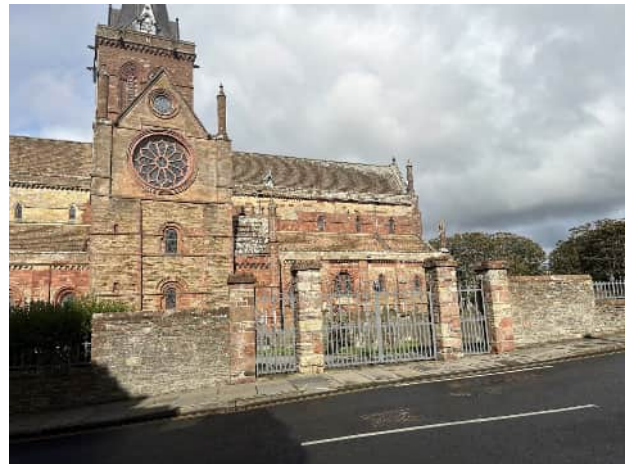
Figure 55: St Magnus Cathedral in Kirkwall was founded in 1137 by the Viking Earl Rognvald in honor of his uncle who was martyred here in Orkney.