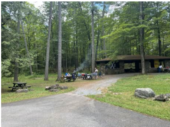
Figure 8: Lake George Battlefield Park Pavilion flying the Saltire and Lion Rampant