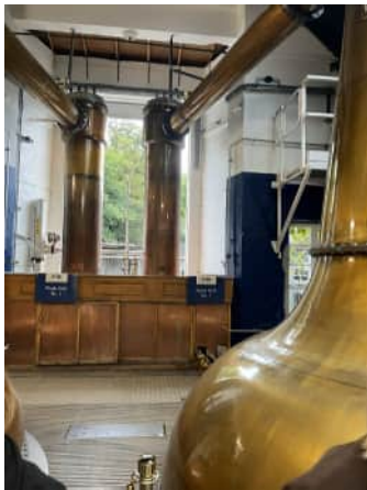
Figure 42: Two stills at Blair Athol