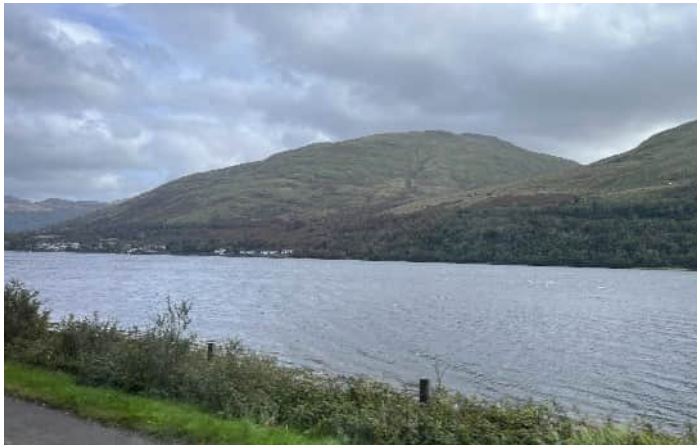
Figure 74: Motoring along Loch Fyne, a sea loch off the Firth of Clyde that forms part of the coast of the Cowal Peninsula on the west coast of Argyll and Bute.