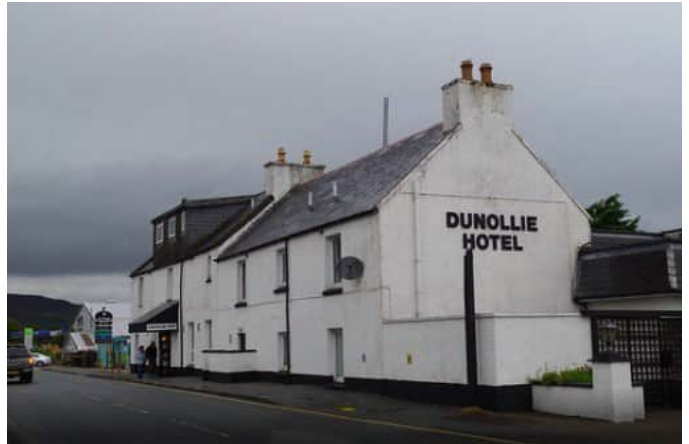
Figure 61: Dunollie Hotel in Broadford, Skye