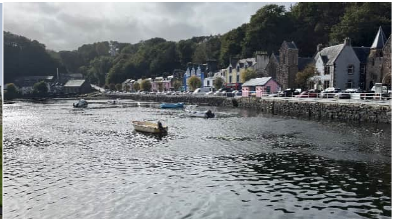
Figure 71: Tobermory